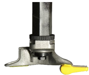
Plastic Demount Head Clamps for added Wheel Protection

Simple Foot Pedal Operation for Table Rotation, Clamping & Bead Breaking