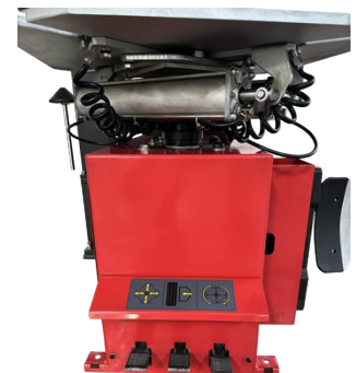
Simple Foot Pedal Operation for Table Rotation, Clamping & Bead Breaking