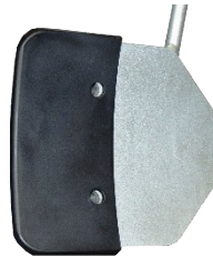
Plastic Sleeve Protector for Bead Breaker