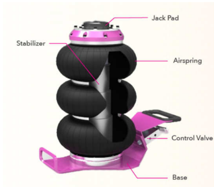
(Three Tier Air Spring without Handle shown)

Depending on the Bag Jack model, the EZ Air Bag Jack is designed to have one to three tiers with or without extension Handle. In special cases, large-sized pneumatic bags can be employed to fulfill the task at hand, if for example the vehicle that is to be lifted is very heavy.